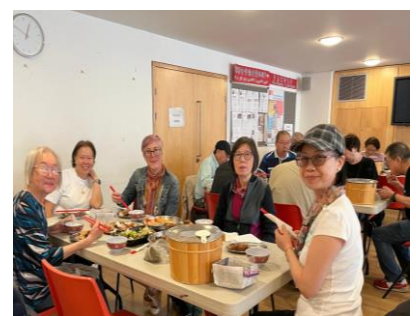
Dragon Boat Festival lunch