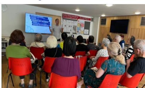
Brain Rover workshop