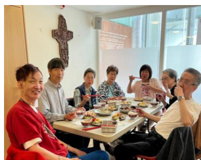
Dragon Boat Festival lunch