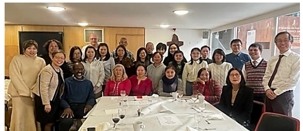
Food Project volunteers and staff