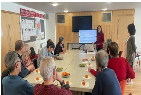
NHS cancer screening promotion