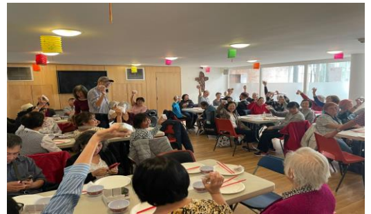
Mid-Autumn Festival Lunch (Sep 23)

It's great to see so many of you attending the recent celebration of Mid-Autumn Festival. We are pleased to announce that from October the Community Centre will open on Saturdays on a trial basis. The new activities in the next quarter include classes on Yoga and Chinese painting, plus several special events. Hope you can find some activities that will be of interest to you.